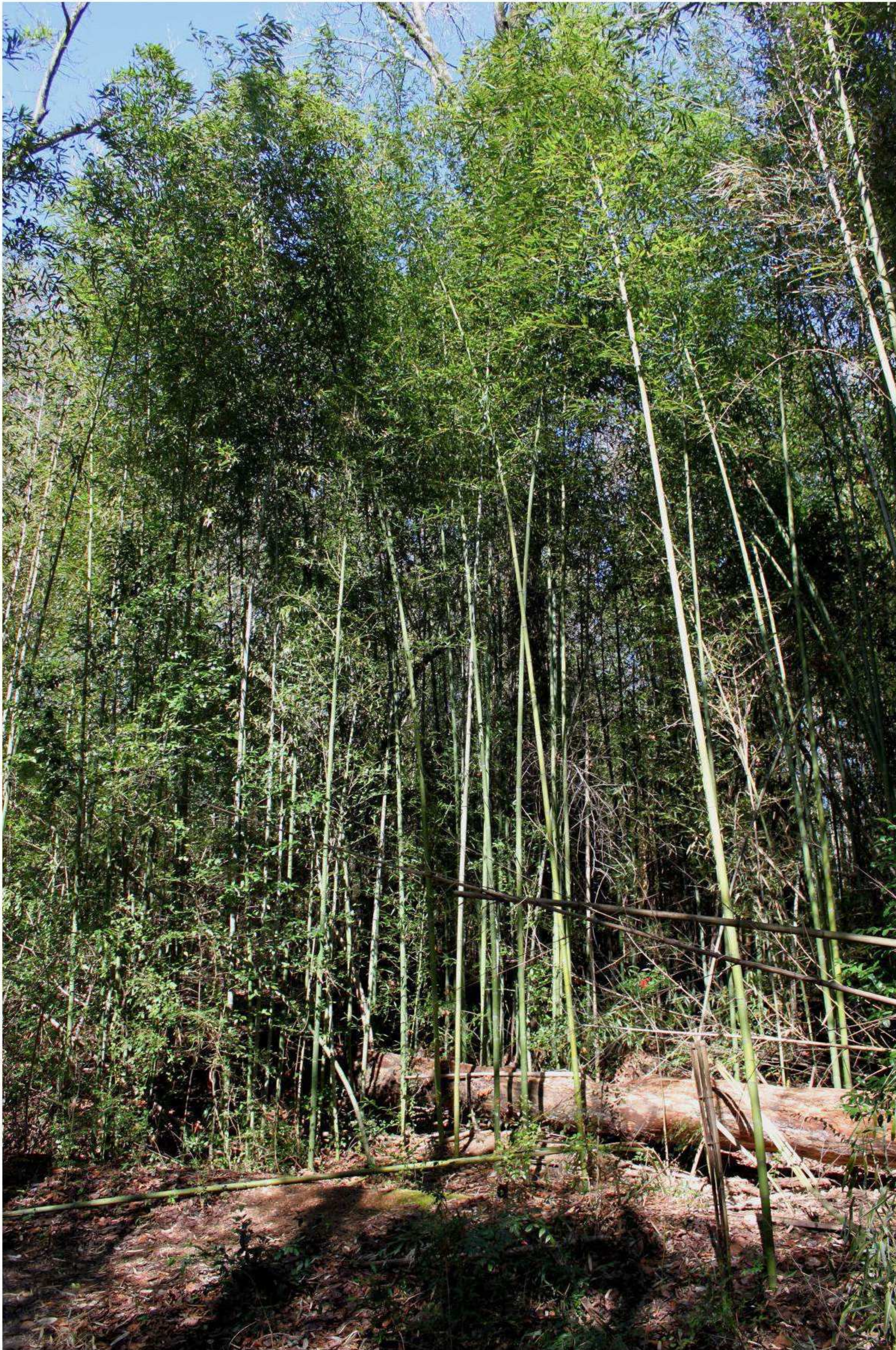
Figure 5. Phyllostachys aureosulcata (Poaceae).